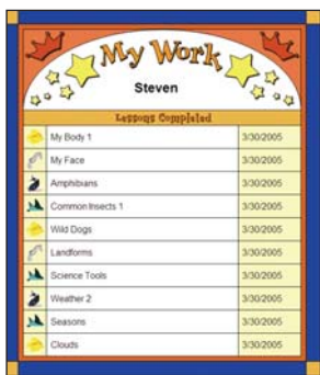
Cheerful, personalized reports present visual progress to students.

Animated Speech Corporation produces customizable, software-based tools and curricula that help increase the rate of learning speech and language skills. Backed by 15 years of university research and tested and refined in pilot school programs, our products are designed to accommodate individual students' needs.