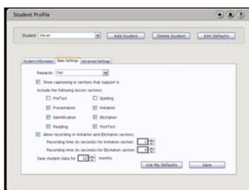
Teachers can customize each child's lesson plan with a variety of options, such as turning captioning on or off and adjusting recording times.