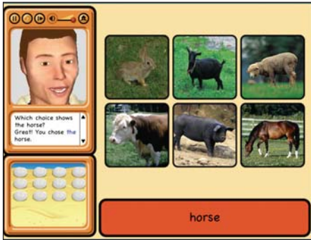
Timo: Vocabulary includes dozens of subject areas and topics including animals, insects, space, the human body, weather, special days, and historical people and places.

From initial pre-test to final demonstration of student understanding, Team Up With Timo: Vocabulary provides an enjoyable and effective way for language-delayed children to measurably increase their vocabulary and improve their speaking skills. By listening and practicing with Timo, your students can learn words before they encounter them in the classroom, building both their confidence and their ability to succeed.