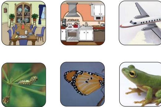
Visually detailed photos and images provide interest and clarity for each lesson.

Some images © 2005 Dorling Kindersley. All rights reserved.